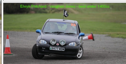
Elwyn Pritchard / Vaughan Jones - best under 1400cc